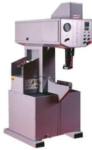
20 Inch Insert Machine