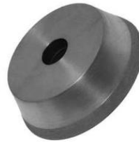
CBN Grinding Wheel