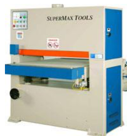
Belt Sanding Machine