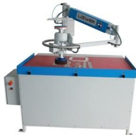
Swing Grinder / Deburring