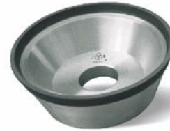
CBN Grinding Wheel