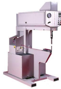
36 Insert Machine