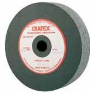
Rubber Abrasive Wheel