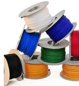
Plastic Consumables for 3D Printing