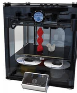
3D Printing Machine