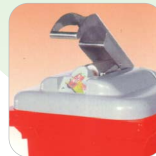
PLASTIC BOTTLE CRUSHER