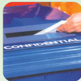
CONFIDENTIAL PAPER SLOT