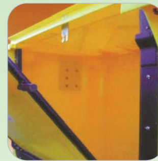
DROP DOWN DOOR