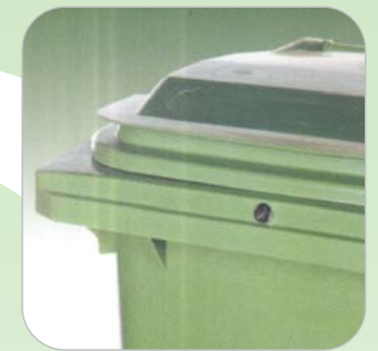
BARREL LID LOCK