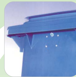
STANDARD LID LOCK