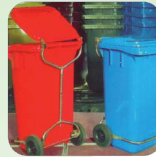
2 WHEEL LID LIFT