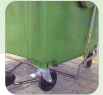
4 WHEEL LID LIFT