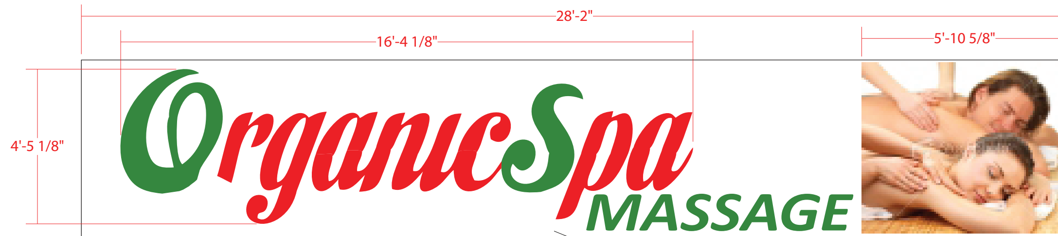
B CUSTOM PYLON SIGN SCALE: 3/8" = 1' 0"

PANFORMED FLAT FACE VINYL GRAPHICS AND PRINTED GRAPHICS WITH LAMINATE