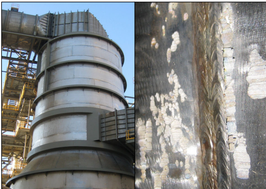
Unprotected scrubbers can experience severe pitting (shown around weld above right) after only a few months in service.