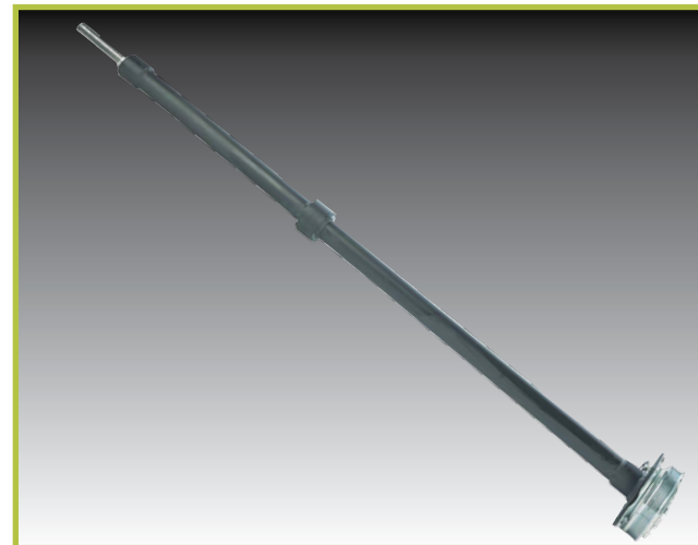
PRECISION BALANCE PTO SYSTEM

With Cleanco's P.T.I. option you'll have hot water and plenty of it. The Cleanco P.T.I. is a tube and fin designed heat exchanger that captures the free hot blower exhaust air. The P.T.I. produces working water temperatures up to 240°F. Available on Compact 45, 47 & 56