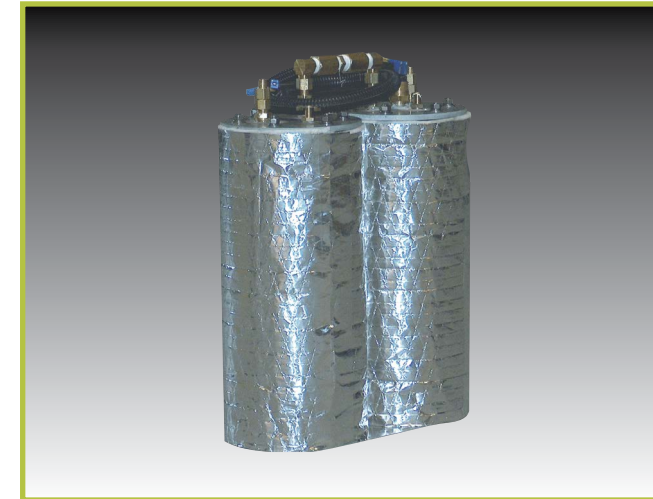
MAXI HEAT DUAL HEAT EXCHANGE