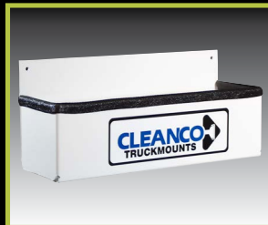
Trigger Sprayer Holder