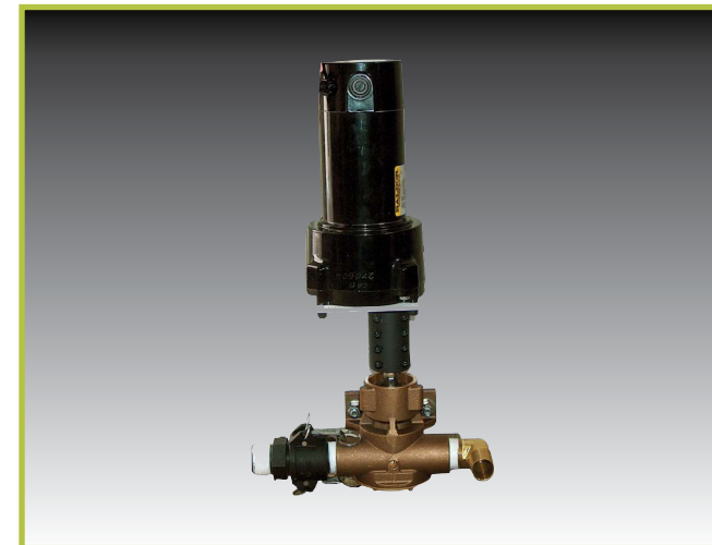
CLEANCO AUTO DRAIN (C.A.D.)

Cleanco Auto Drain is externally mounted on the waste tank. Easily accessible for cleaning and servicing. The C.A.D. will produce a flow rate of 4.5 GPM under 14" hg. The C.A.D. has no filters or check valves to clog.