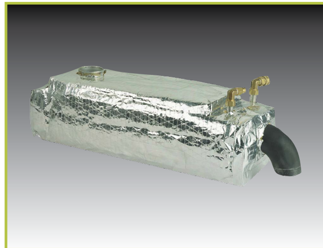
CLEANCO P.T.I. (Post Thermal Increase)

With Cleanco's P.T.I. option you'll have hot water and plenty of it. The Cleanco P.T.I. is a tube and fin designed heat exchanger that captures the free hot blower exhaust air. The P.T.I. produces working water temperatures up to 240°F. Available on Compact 45, 47 & 56