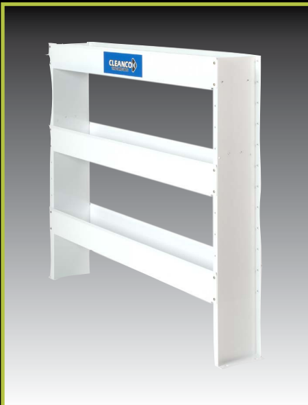
Van Shelf 3 Tier