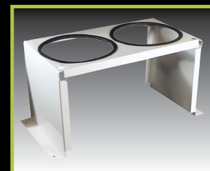
Double Sprayer Holder