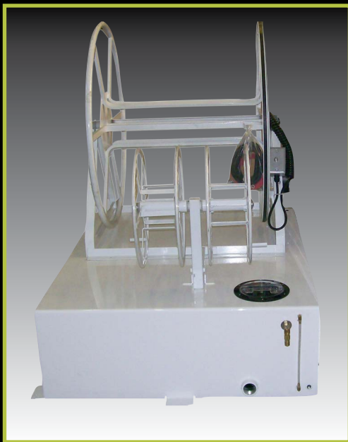
120 Gallon Horizontal Tank with Electric Reel