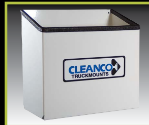
Foam Block Holder