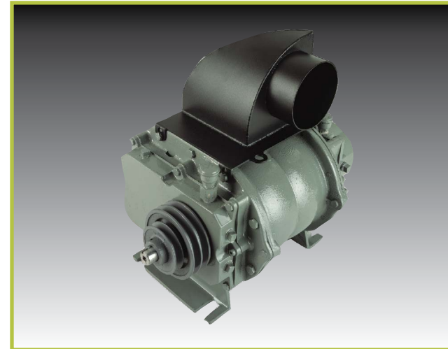
ROOTS WHISPAIR DSL BLOWER