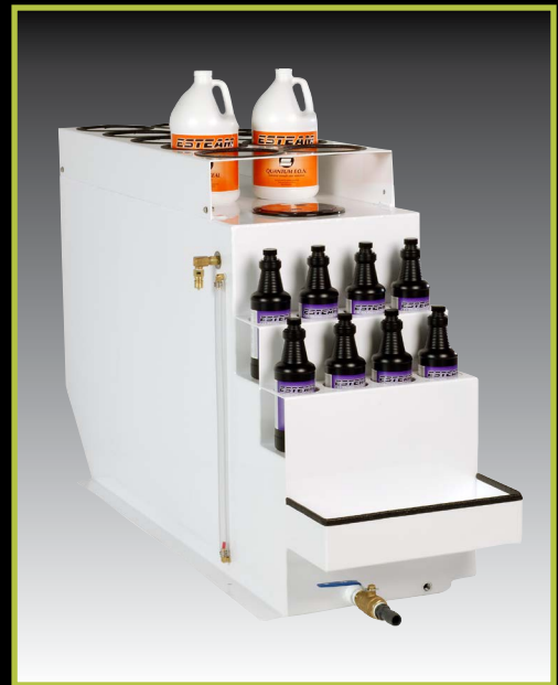
120 Gallon Aqua Storage Tank