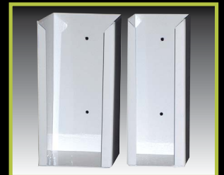
Furniture Tab Holder