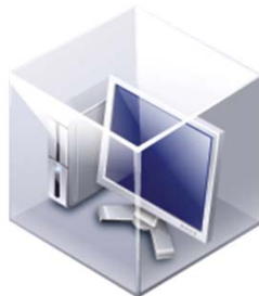
Icon #7 (Virtual Desktop)