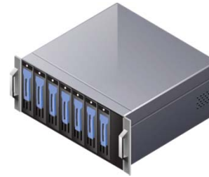
Icon #4 (Storage)