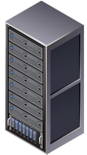
Icon #5 (Rack)