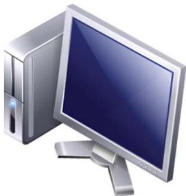
Icon #6 (Desktop)