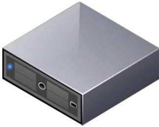
Icon #1 (Server)