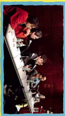
Filmmakers panel discussion (2008)

All foreign language films are subtitled in English