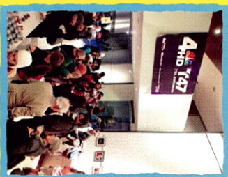
Meet The Filmmakers Special Program, King Juan Carlos I of Spain Center at NYU (2007)

Special programs are open to the public free of charge