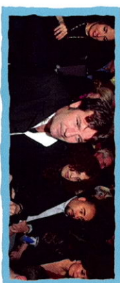
Jorge Perugorria (2007)

In recognizing the year's finest achievements in Latin American cinema, HFFNY honors the festival's best film, best director, and best screenplay with the Havana Star Prize . The award is presented to honorees on closing night.